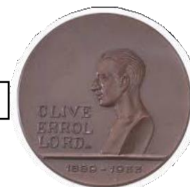
Clive Lord Memorial Medal