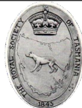
The Royal Society of Tasmania Medal

The Awardee will deliver 'The Royal Society of Tasmania Lecture'.