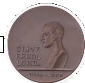
Clive Lord Memorial Medal